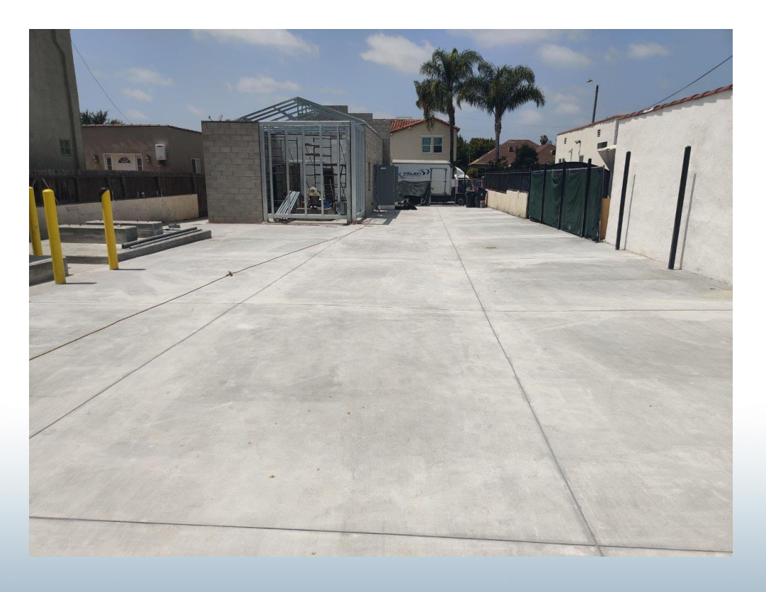
Framing, Painting, Pavement